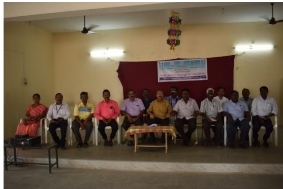
Teacher Coordinator Training NGC