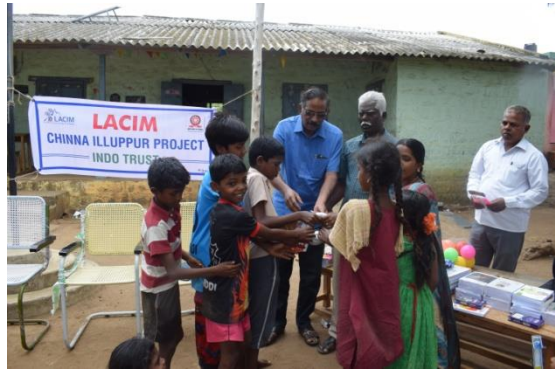
Note Book & Playing Material Distribute