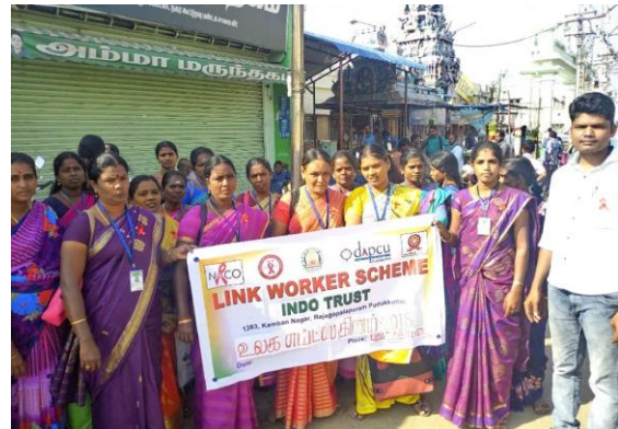
World Aids Day Programme - LWS Pudukkottai