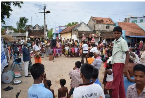
TWAD Cultural Programme