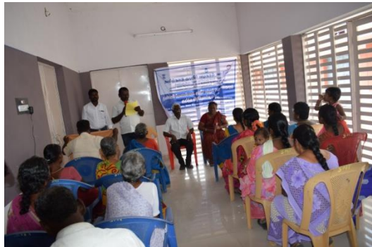
Water Management Meeting