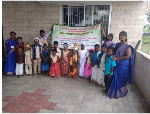
EIC – HI Centre Teacher & Student Perambalur