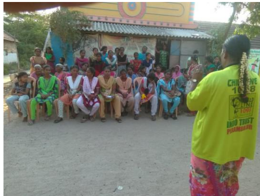
Adulesant Girls Awareness Programme