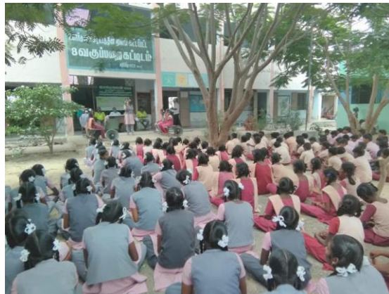
School Programme Govt. High. School Neikkuppai