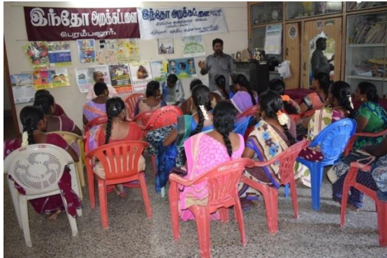
Internet Saathi Review Meeting