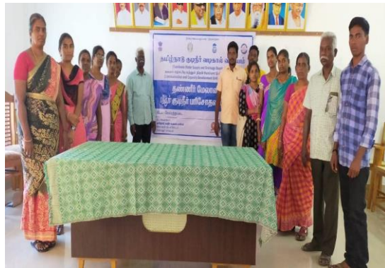
Water Management Programme