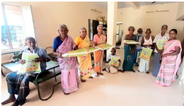
NULM - Ariyalur