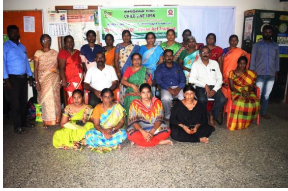
Staff Capacity Training