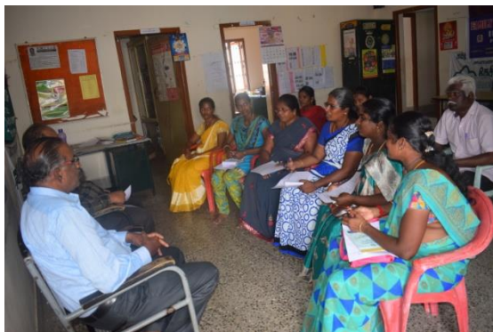
Child Marriage & Child Sex Ratio Survey Team