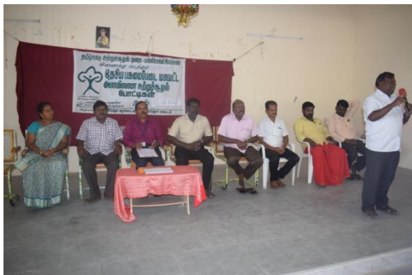
Competition - NGC