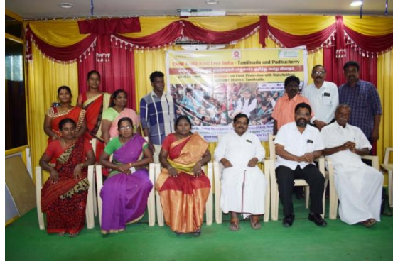
Child Friendly Group Member