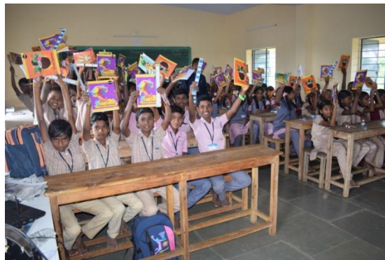
Note Book & Playing Material Distribute