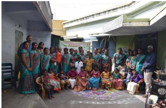
Pongal Festival EIC-HI centre