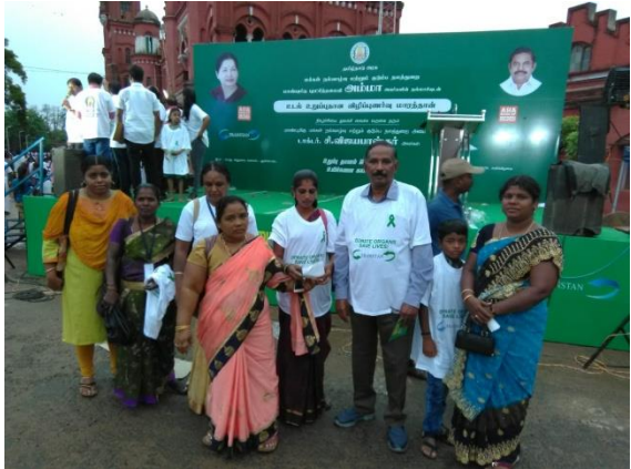
HIV/ AIDS Marathon