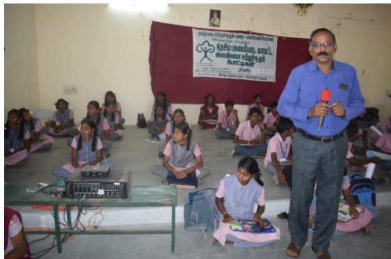
Competition - NGC