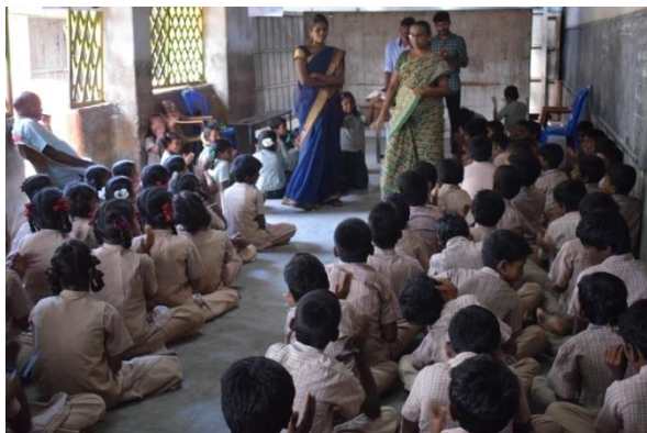
School Awareness Programme