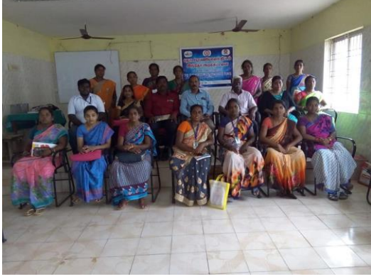
TB – Coordinator Meeting Link worker Scheme